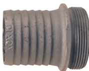
1" - 2-1/2" male